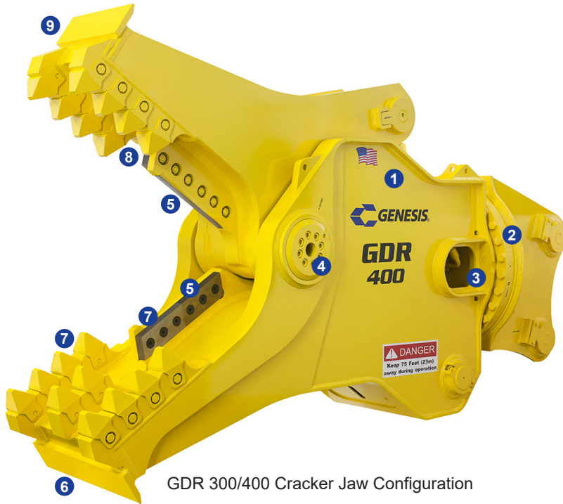
GDR 300/400 Cracker Jaw Configuration